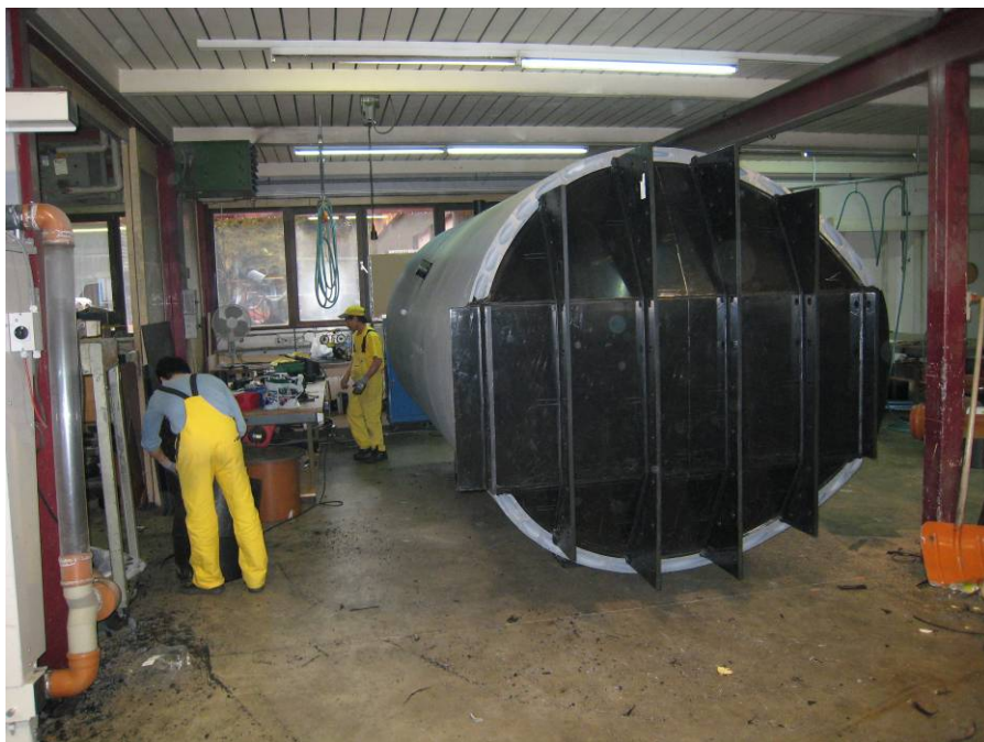
Tank with reinforced inclined base (for laying in the vicinity of the water table)