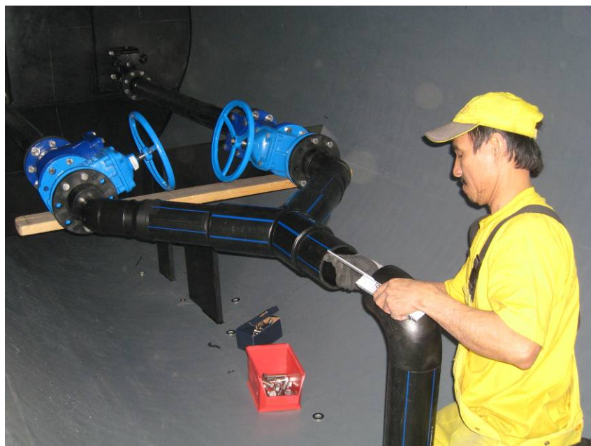
Mounting the discharge outlet in PE pressure